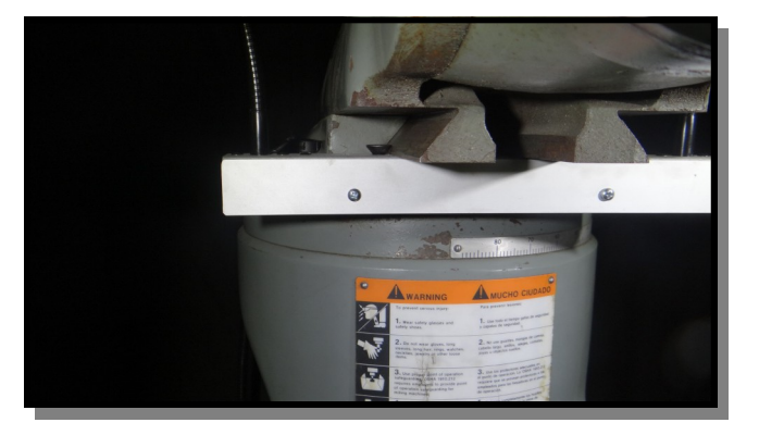
EZ ram dovetail "slide-on" mounting with no holes to drill or tap

Babin Machine Tool 508-588-9189 Contact: sales@BabinMachine.com