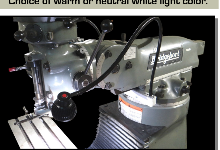
Flexible lighting positioned where you need it with 30 inch length steel flex arm