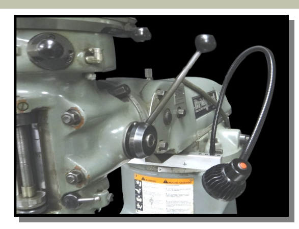
EZ position steel flex arm does not interfere with quill handle operation